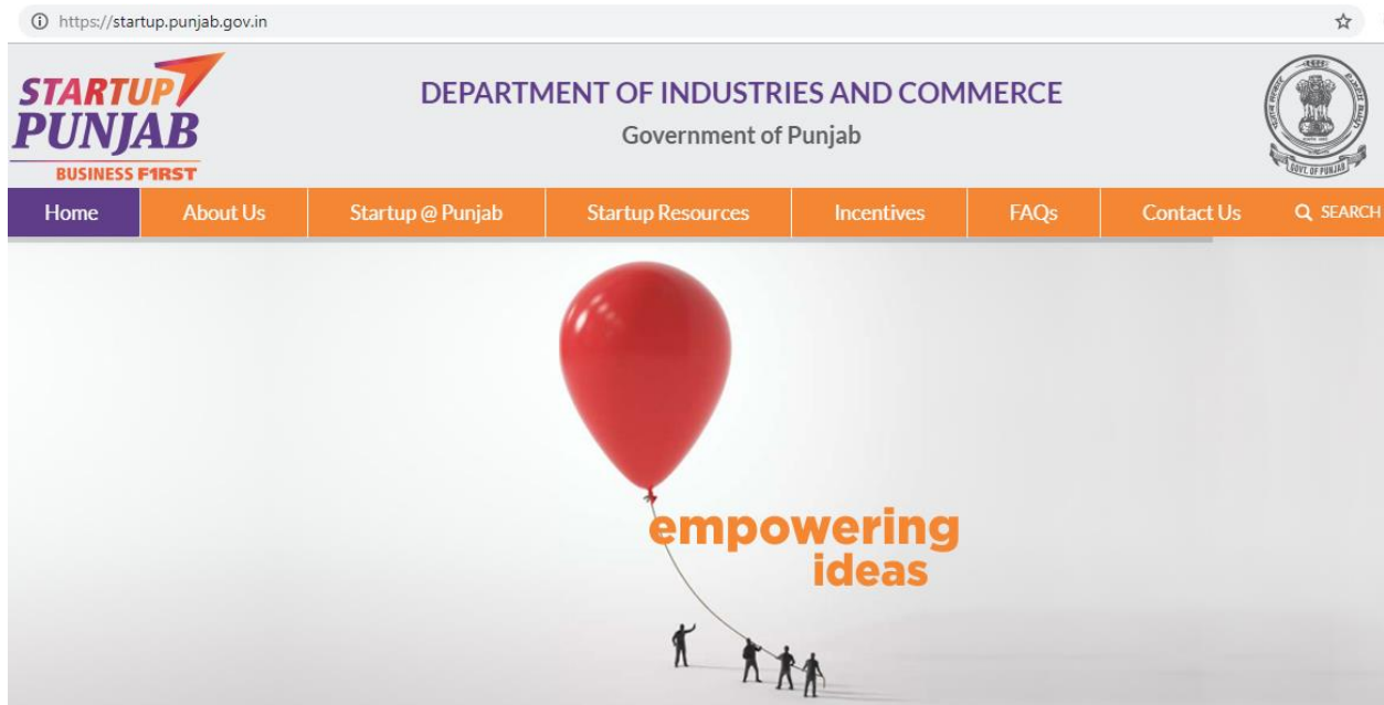
Startup portal of Punjab

The portal provides important information or updates of the activities planned in Punjab Startup ecosystem. Secondly, it also brings together the entire Startup community on a single platform by creating a mentor network, listing investors, Startup outreach events, etc.