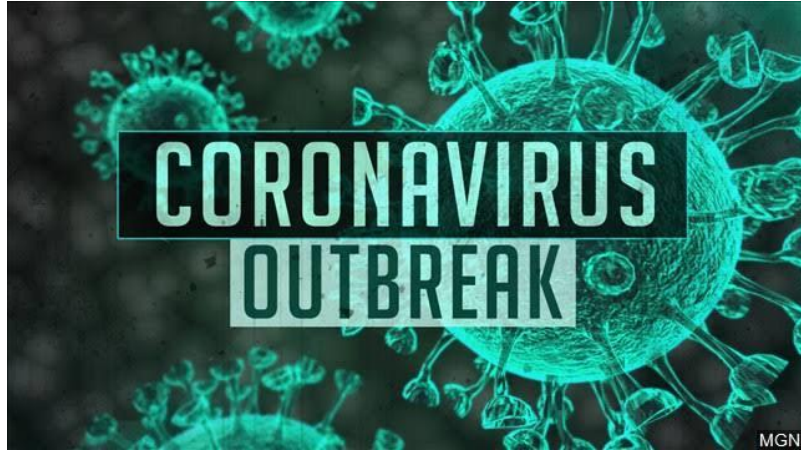
of the virus began to show a gradual increase.

quarantine facilities. As a result the number of patients